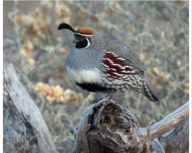
Gambel's Quail