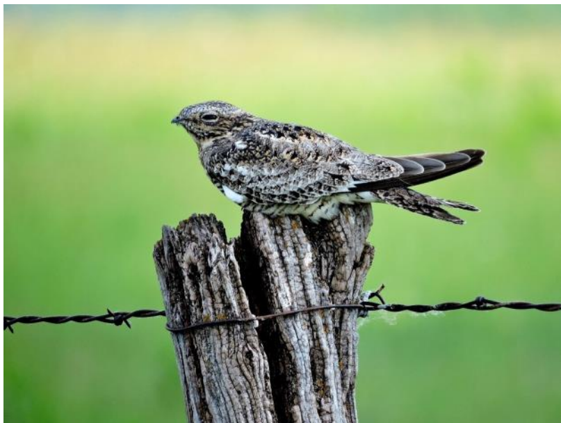
Common Nighthawk

No limit of participants, although roadside pullouts are limited. Rocky road conditions vary but accessible to most low clearance vehicles along a dusty road.