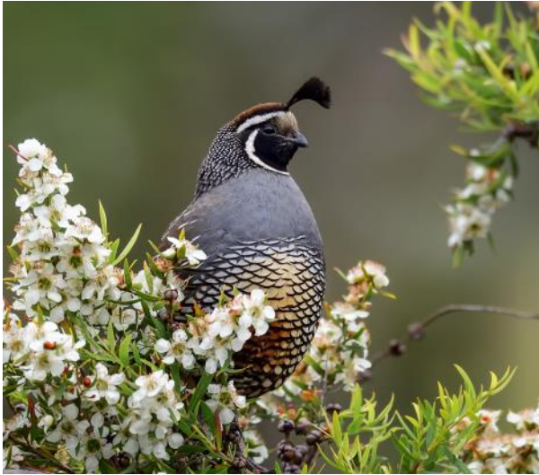
California Quail