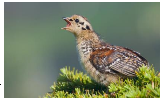
Spruce Grouse (juvenile), Audubon Alaska

also sets a precedent that threatens the future of roadless areas on national forests in Washington.