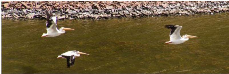
American White Pelicans

Nov. 20 , Despite it being so late in the fall, Cindy McCormack managed to find an amazing four species of warblers at Vancouver Lake, COM-