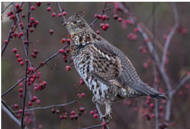
Ruffed Grouse

Oct. 21 , While working in our woods I flushed a RUFFED GROUSE and heard a NORTHERN PYGMY-OWL .